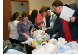
Students sort groceries after returning from the store.

to choose produce, meats, and find canned goods at the store.